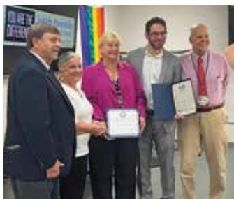
Standing with Congresswoman Wild to fight suicide.

Congresswoman Susan Wild recently announced federal support to bolster suicide prevention work through Pinebrook Family Services and the Suicide Prevention Coalition of Lehigh County.