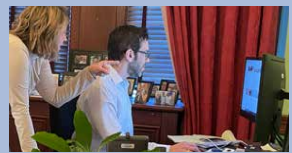
Let us search www.PaTreasury.gov for you!

There is no cost to file your unclaimed property claim if you do it on your own or through my office.